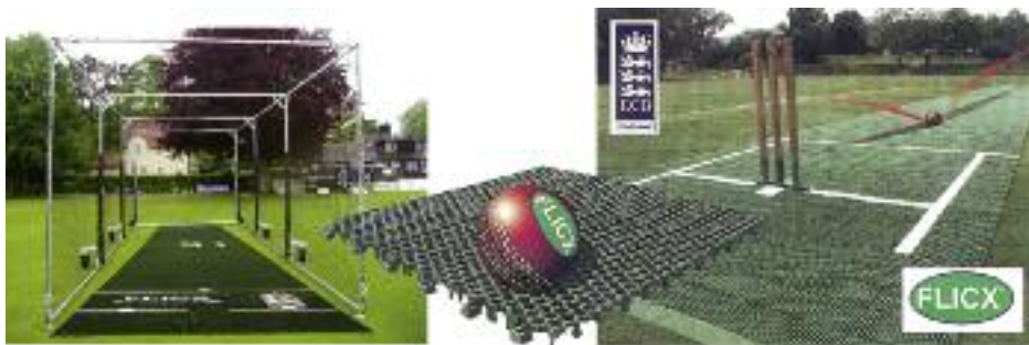
Johnjac 10m cage and Flicx Pitch

Contact Johnjac for your Flicx Pitch and bowling machine enquiries