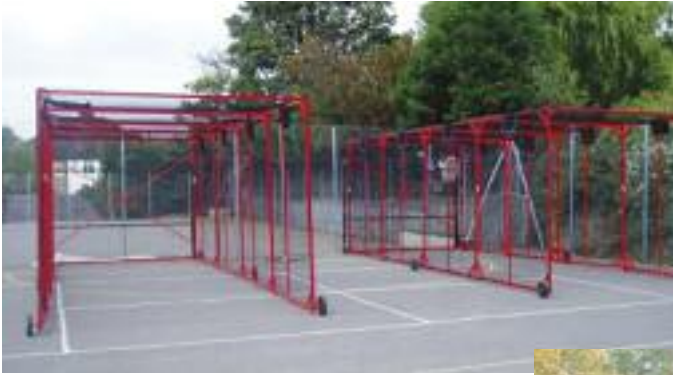
Two Concertina Cages in a school playground