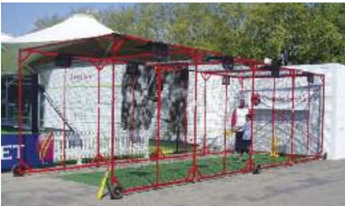
Concertina cage at Lords Cricket Ground