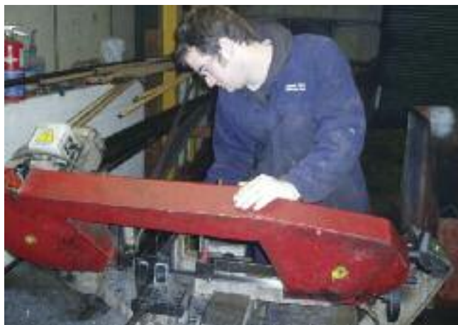
Cricket equipment being made in our factory.