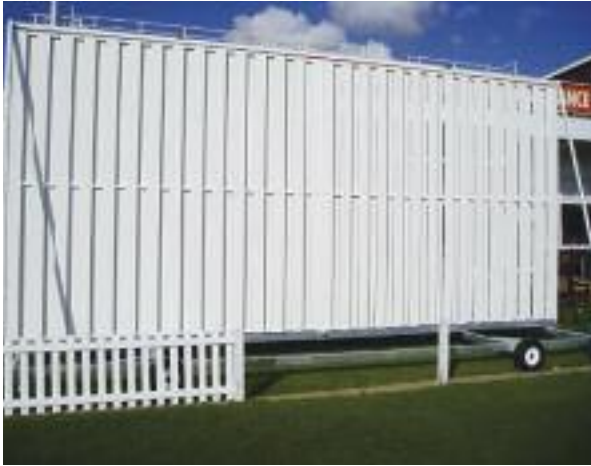
Bespoke mobile 8m plastic revolving white/black sight screen, Leicestershire CCC