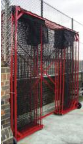
Concertina in the closed position in a rooftop playground in a London school