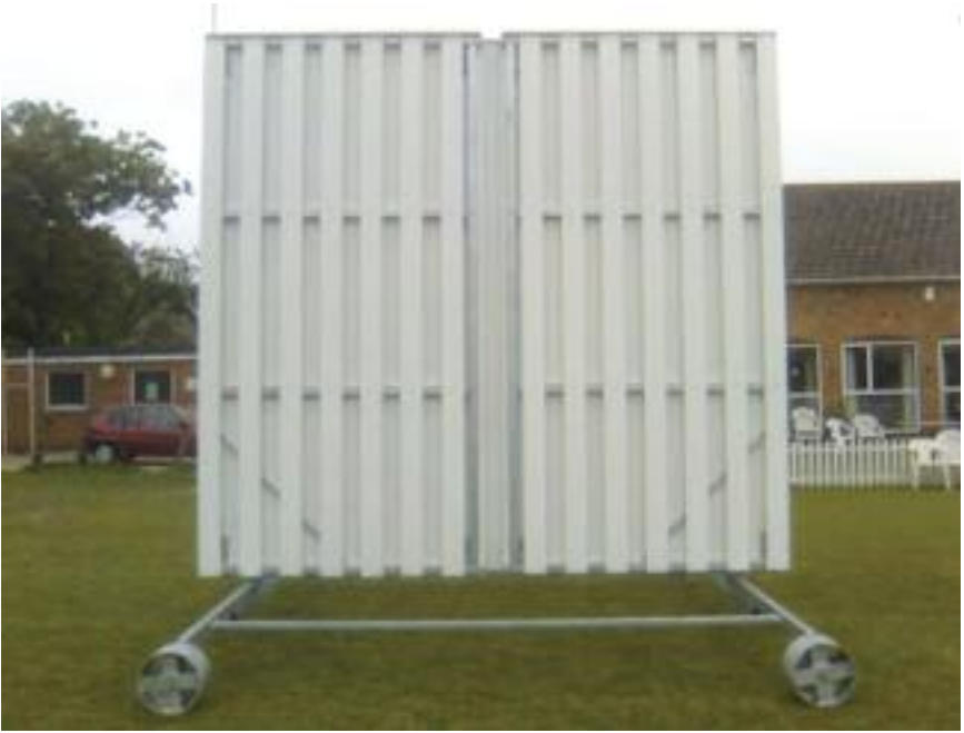
4m Std Plastic Sight Screen 8m Folding Plastic Sight Screen