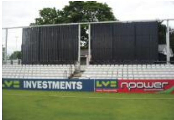
Bespoke 8m plastic revolving white/black sight screen on a fixed track & column system, Essex CCC

Manufactured in the UK in our own factory to customers' specific requirements.