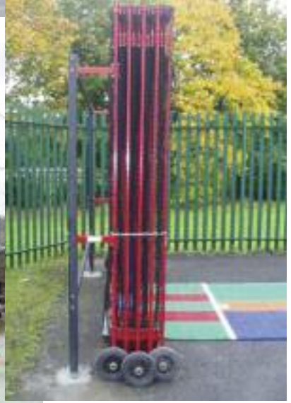
Concertina in the closed position supported by back posts